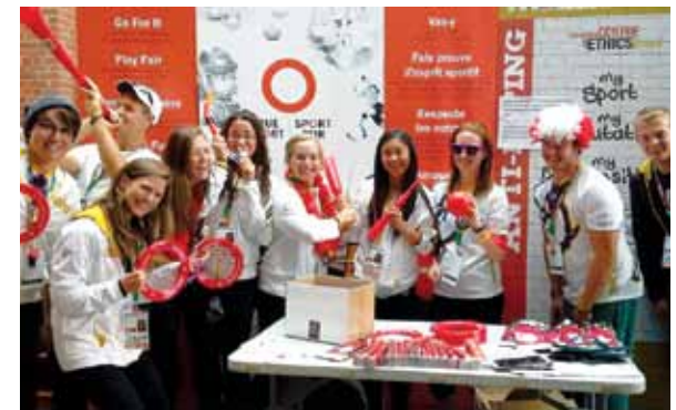
True Sport photo booth at the 2013 Sherbrooke Summer Canada Games