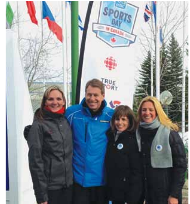
RBC Sports Day in Canada media tour

In recognition of the belief that good sport can make a great difference, the Summer Games host society declared the 2013 Sherbrooke Summer Canada Games a True Sport Event. Athletes, coaches and officials pledged their commitment to the True Sport Principles as part of the opening ceremonies. A True Sport outreach booth was also set up at the athletes’ village for athletes to learn about values-based sport initiatives. A photo challenge engaged athletes and participants to capture and share their favourite True Sport Games moments.