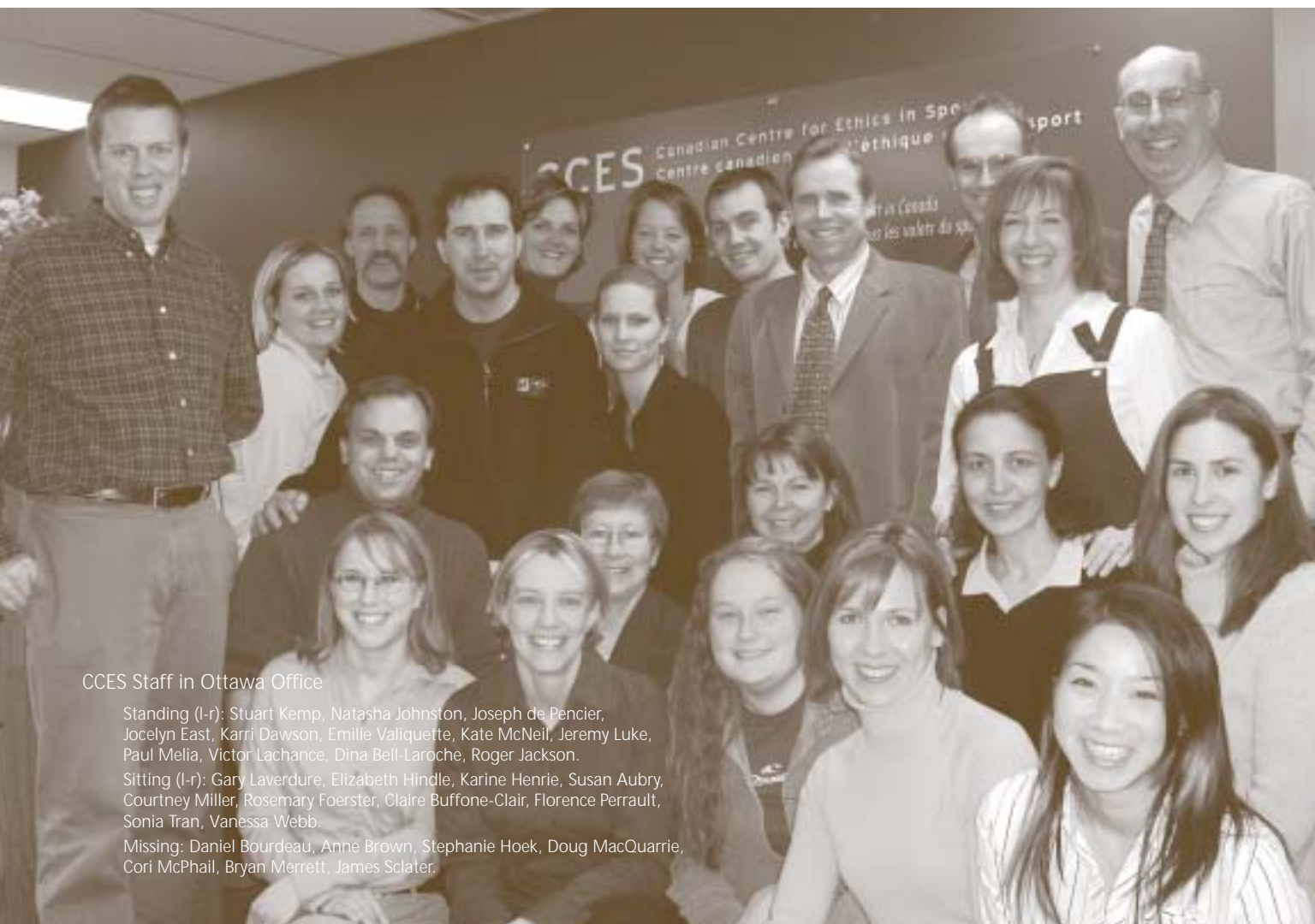
CCES Staff in Ottawa Office

The CCES welcomes expressions of interest or the identification of individuals who may wish to serve the organization in a volunteer capacity. The CCES Board of Directors is comprised of recognized Canadians with expertise in the various fields of knowledge required to ensure the proper stewardship of the CCES. If you are aware of an individual whom you believe could contribute to the CCES, please email nominations@cces.ca .